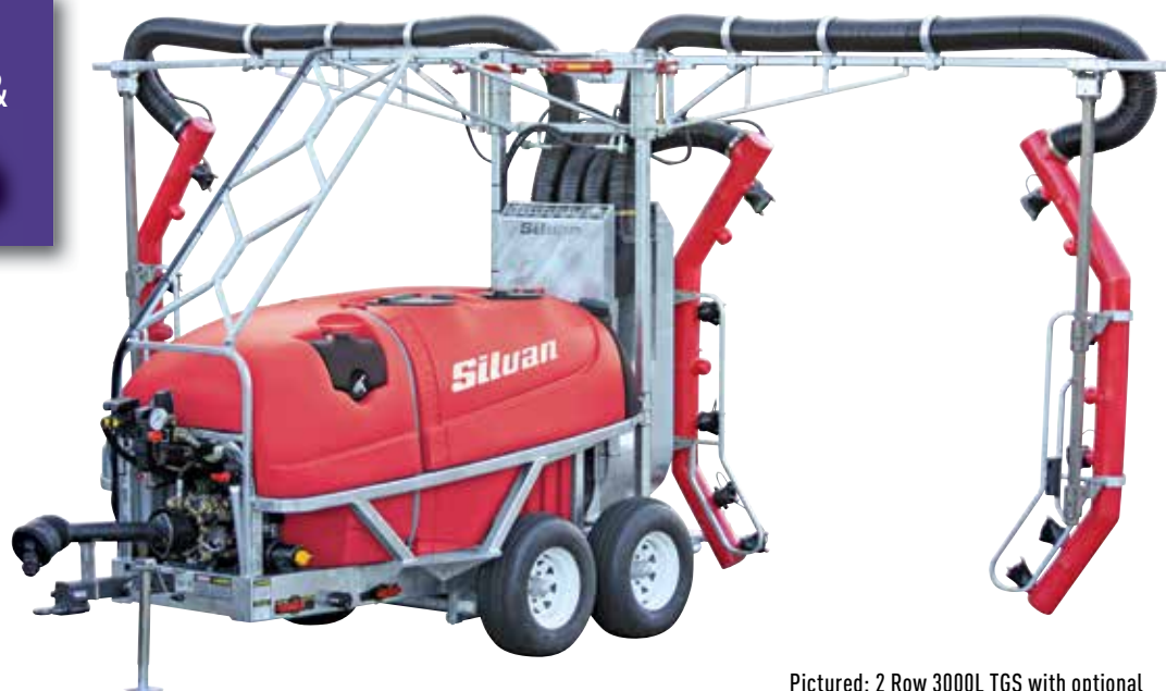
Pictured: 2 Row 3000L TGS with optional twin galvanised snorkel