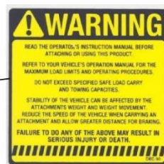
55 and 100L P/No DEC48