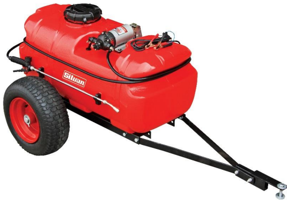
SP100-R2 with optional TR100 (Trailer)