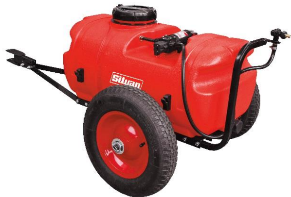
SP55-R1 with optional TR55 (trailer) and TR55-10 (Boomless Nozzle Kit)