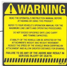
55 and 100L P/No DEC48