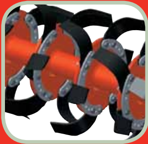
Rotor with "C" helicoidal blades