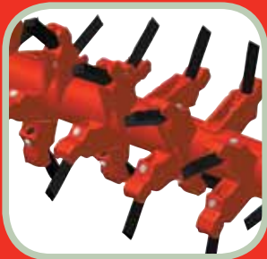
Rotor with spike blades "SPIKES"