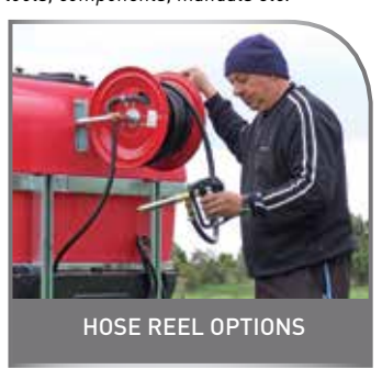
Robust, rear-mounted hose reel options for proficient spot spraying.