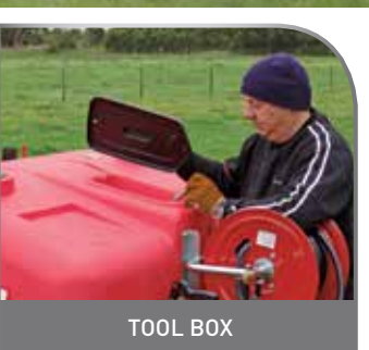
4 litre fully sealed tool box for storing tools, components, manuals etc.