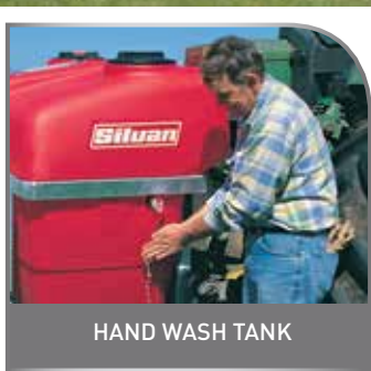
In built 15 litre water hand wash tank for easy clean up or nozzle rinsing on-the-go.