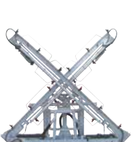
12 metre HD Devil boom